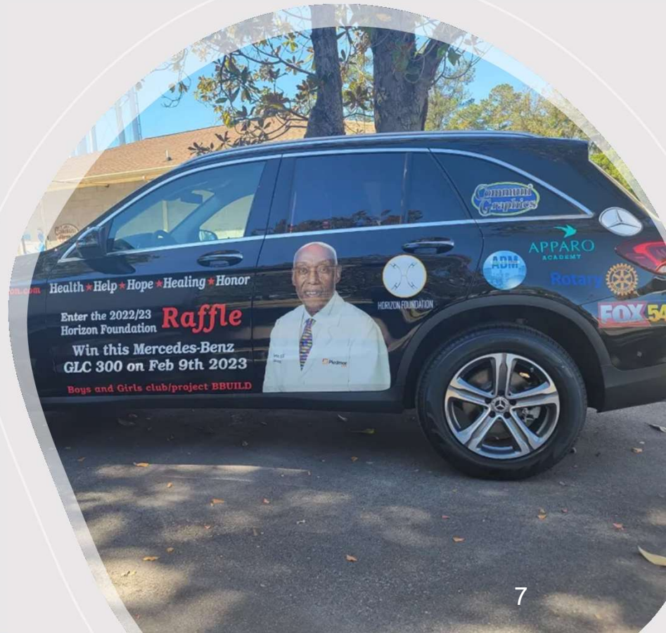
Fund raiser final report and check presentation